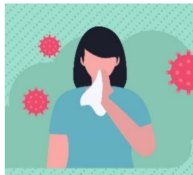
Use tissues, then throw them away