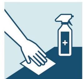
Keep objects and surfaces clean

Call your doctor again if you are getting worse. Call back if you are having trouble breathing. Do what your doctor says.