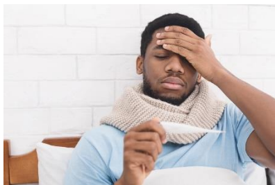
A fever of 100.4° or higher